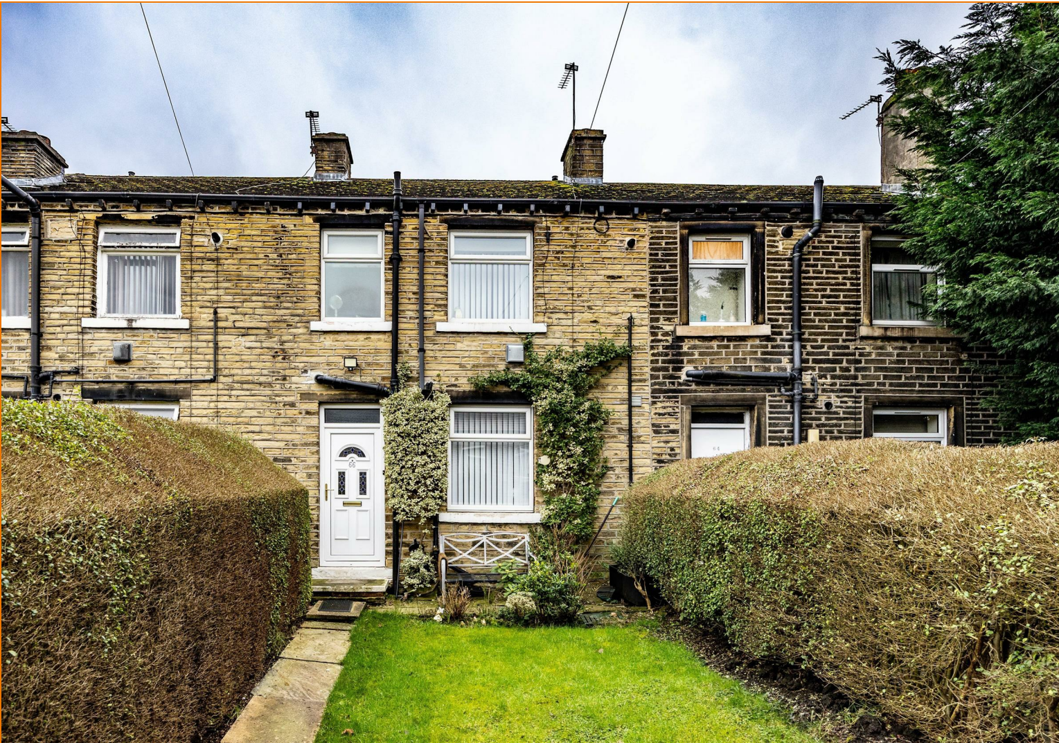
Fartown Green Road Fartown, Huddersfield, HD2 1AE